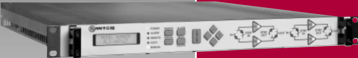
DUAL 1:1 UNIT